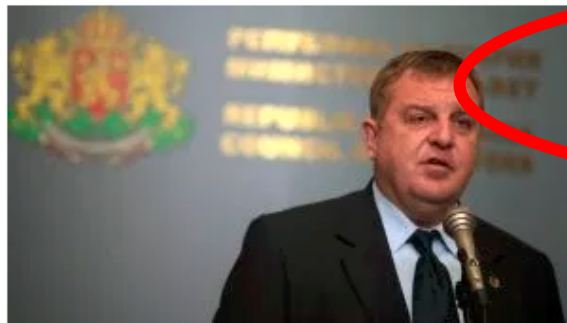
Defence minister Krassimir Karakachanov

May 23, 2018 By Editors — Leave a Comment