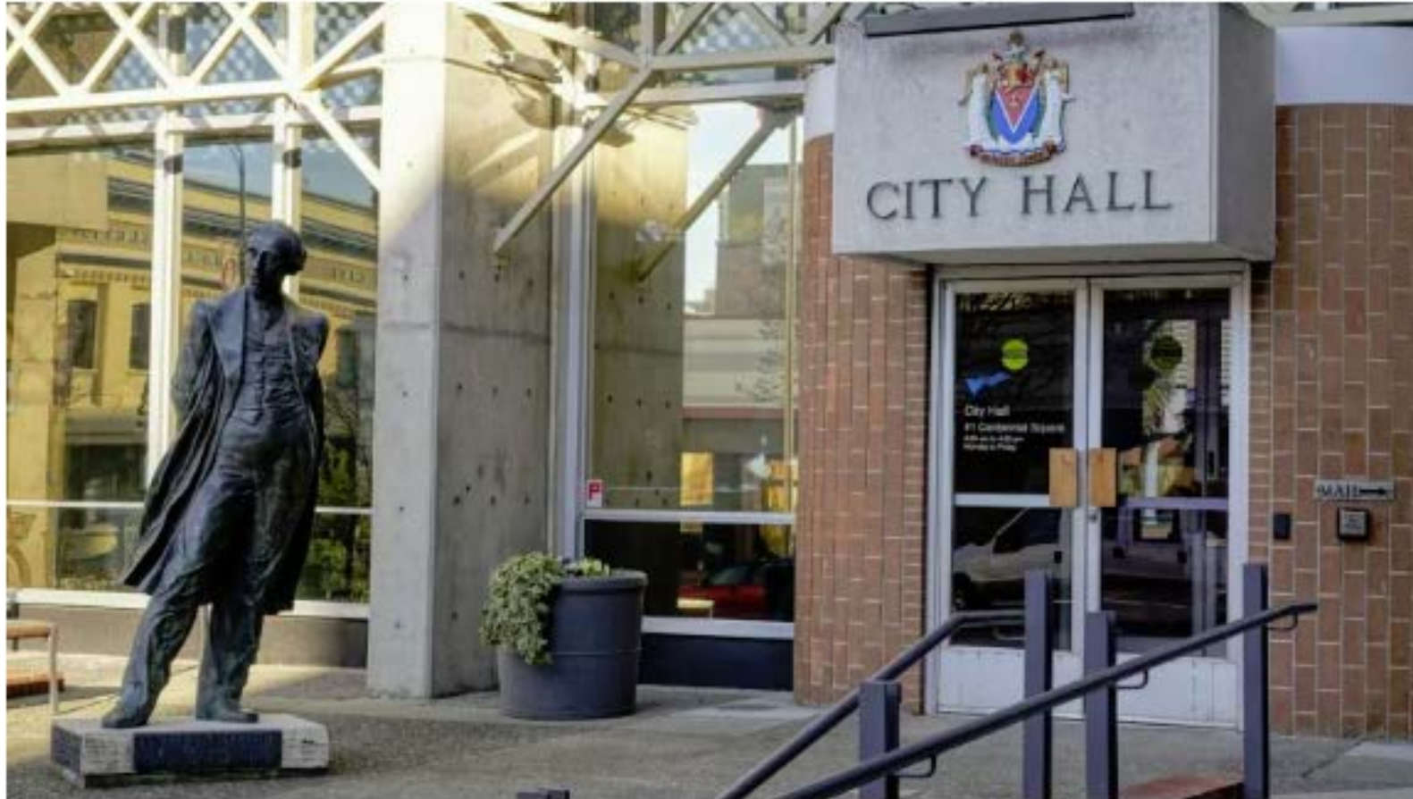
The statue of John A. Macdonald was removed from the front steps of Victoria City Hall in British Columbia in August.