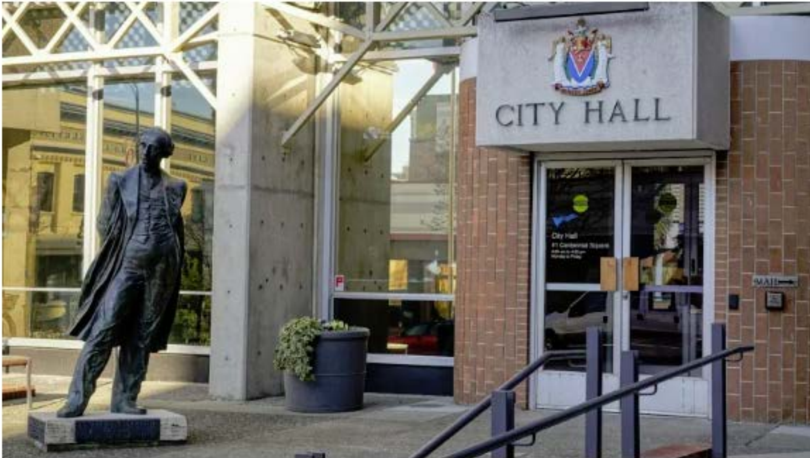
The statue of John A. Macdonald was removed from the front steps of Victoria City Hall in British Columbia in August.